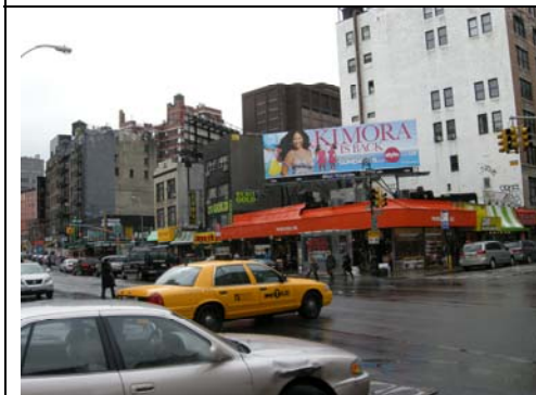
SE Corner Canal & Lafayette