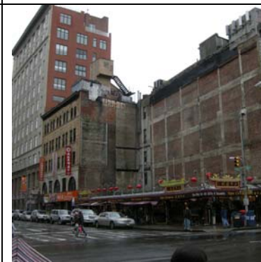
Under-built NE Corner Canal Lafayette