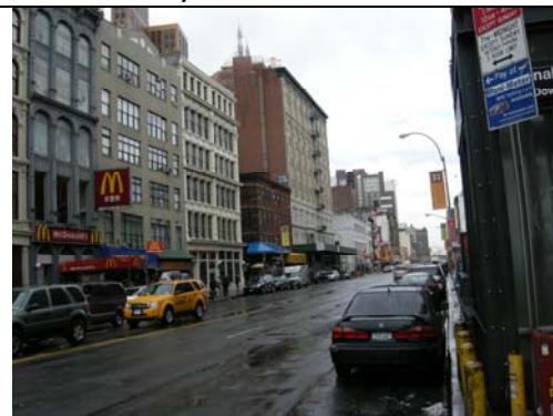
Under-built Parcels South Side Canal from Lafayette to Mercer