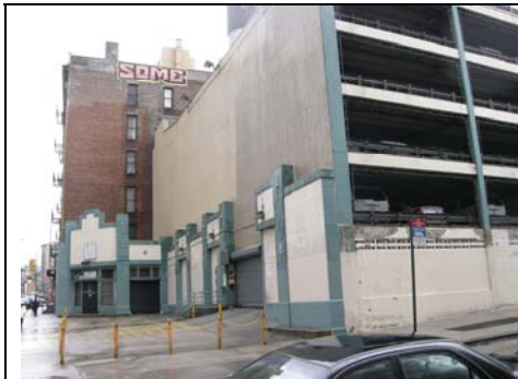
DCAS Parking Lot at Laf & Howard