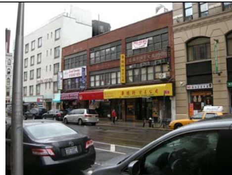
126-128 Lafayette St.